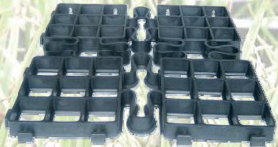
LOCKGRID™ ONTOP Soil Retention 1"