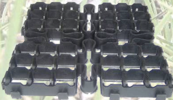
LOCKGRID™ Elastic Paddock 2"