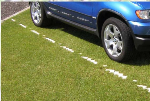
LOCKGRID™ 2000 parking with white marking inserts