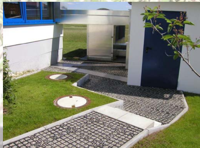
LOCKGRID™ 2000 walkway