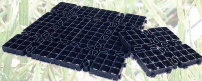
LOCKGRID™ 2000 Soil Retention 2"